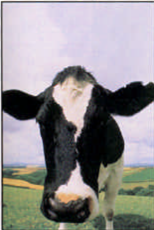
5. CATTLE DISEASE