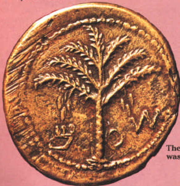
The palm tree on this ancient Jewish coin was used as a symbol of the Land of Israel.

“I am only a lamp,” Jethro answered, “but you are the sun and Aaron is the moon. Where the sun and moon give light, no lamp is needed. I must return to my people and teach them God’s ways. The lamp is best in a place of darkness.”